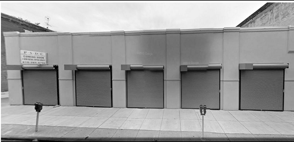
4821 Frankford Avenue

Unfortunately the zoning notice posted did not include the information required and the case will be continued until next month's meeting.