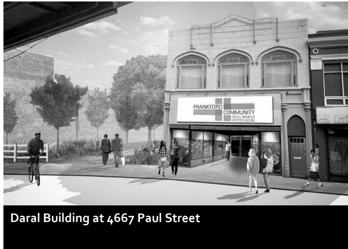
Daral Building at 4667 Paul Street

Currently, we are building out the café space in the first floor storefront. This space will serve multiple purposes. First, it will provide a space for the Frankford CDC to incubate a new business. Second, it will bring a new business model to