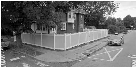
1100 Haworth Street

A special meeting of the Northwood Civic Association met on February 7th to consider a zoning variance for an existing fence at 1100 Haworth Street. The variance is needed because the 6 foot high fence exceeds the maximum height of 4 feet. After discussion of the issue, residents voted to not support the vari-