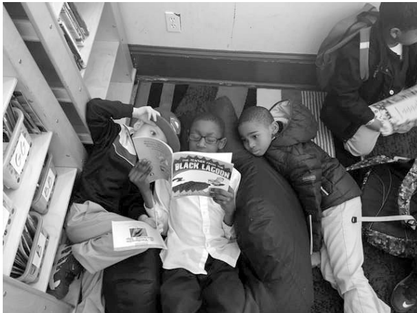
Reading is something these boys enjoy at the Northeast Frankford Boys and Girls Club