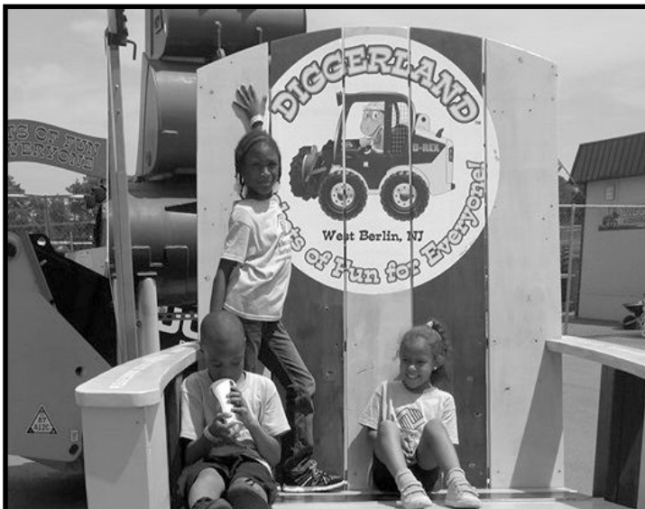
Kids from the Frankford Boys and Girls club took a trip to Diggerland USA this month

Visit the Frankford Gazette online at www.frankfordgazette.com using your smartphone, tablet or computer to access the articles containing the links to bonus information. Try it today!