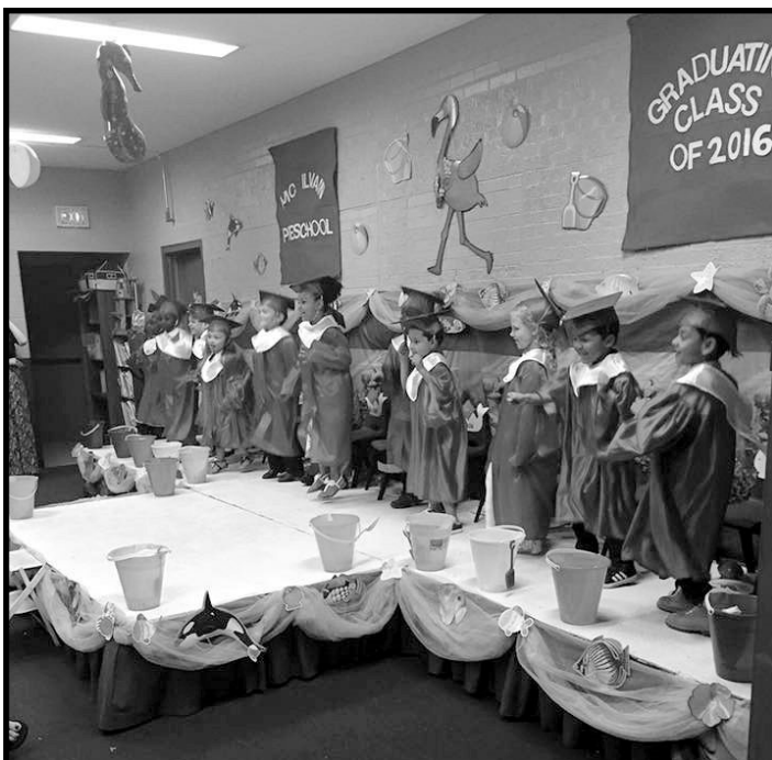
Congratulations to the graduates of 2016—McIlvain Preschool

Visit the Frankford Gazette online at www.frankfordgazette.com using your smartphone, tablet or computer to access the articles containing the links to bonus information. Try it today!