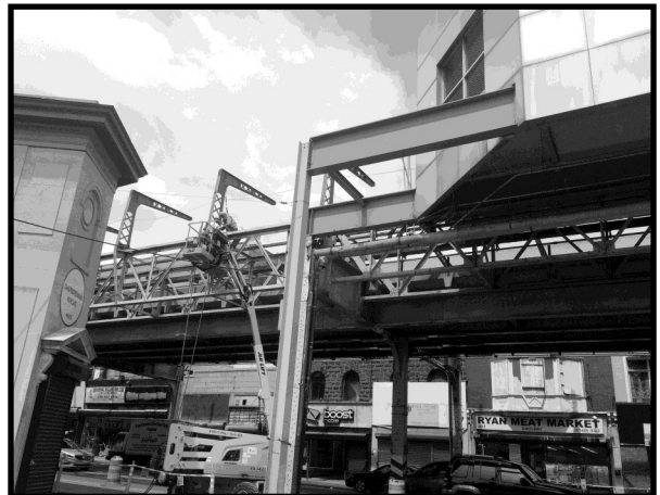
SEPTA construction wakes up the residents of the Meadow House every morning.