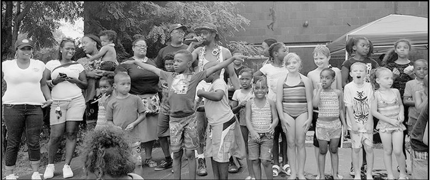
Kids of all ages had a great time on July 16th at Reclaiming the Community day.