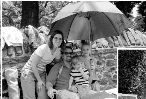
Flea Market Day at Overington