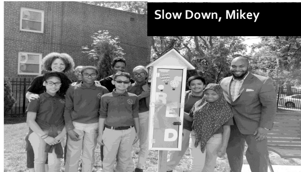
The Little Libraries Team at Northwood Academy Charter School