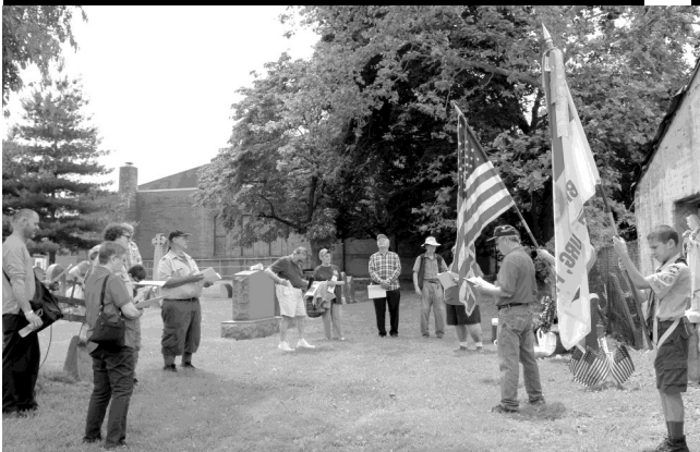
Memorial Day Observance St. Joachim Cemetery