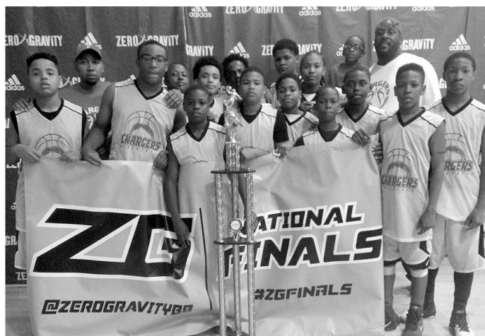
Frankford Chargers Championship Team ZG Tournament in Boston 13 and under

The Frankford Chargers 13 and under basketball team went up to Boston in June and showed them how the game is played at the ZG tournament. They came back as champions.