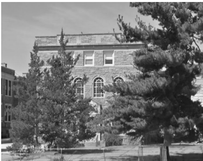
5020 Harbison Avenue

of time before we start to see implementation. Continuing to look to improvements to Ramona and Adams.