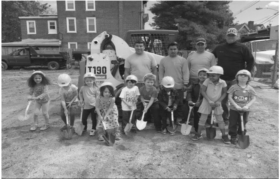
Ground Breaking day at the NEST

Each of these spaces was designed to foster experimentation and collaboration among the students. Students will learn to identify and understand real-world problems, and to use teamwork and strategic thinking to find solutions.