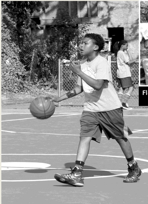
Donovan Williams Memorial Foundation Annual Basketball League