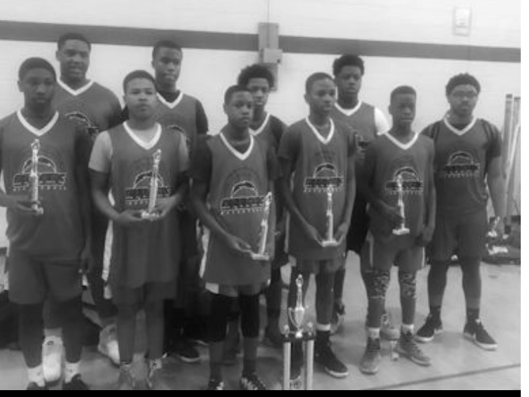
Frankford Chargers 14U Champs

To top off my weekend, the kids at the tiny tot banquet....They looked so cute. They were smiling for pictures and they had their own swag. Thank you, parents, for dressing them up!!! The smiles on their face when they got their trophies was priceless. Thanks to all who help make it a success. The coaches, administrators, refs, parents and, most importantly, the kids.