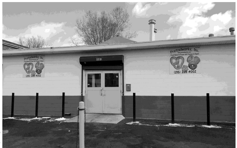
Pretzel Works—5331 Oxford Avenue

Pretzels are 3 for 2 dollars. Toppings are available. Drop in and see those guys, say hello, have a pretzel. Open Monday through Friday from 6 AM to 2 PM. 215-288.4002.