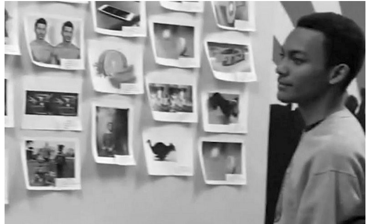
One display of photography

Alums who have not been to the school for a while might enjoy a walk down memory