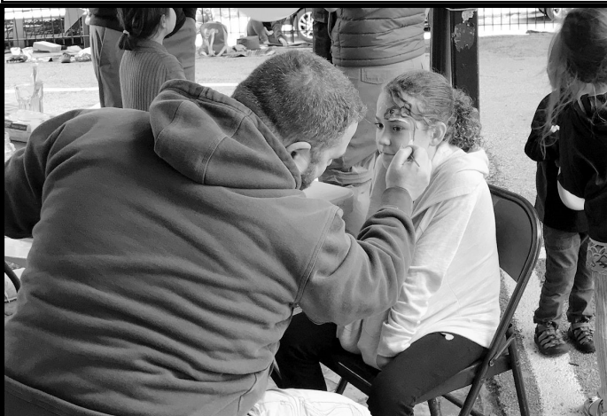
There was a lot of fun and games at the Spring Fair at FFS on May 20th. Above you can see it takes a steady hand for face painting.