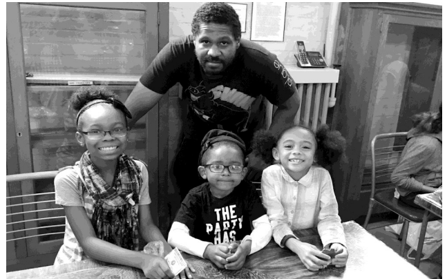
These young ladies, watched over by their dad, were selling cup cakes at the Flea Market held at the Historical Society of Frankford on May 20th.