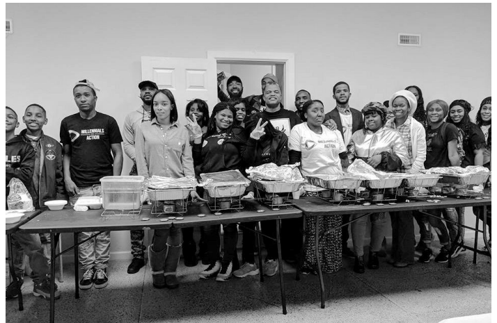
Town Watch Integrated Services and Power Circle Mentors held this event on Sunday November 19th.

There were many efforts to reach out to those in need during the Thanksgiving holiday. Thanks to the volunteers above who took the time out to help their neighbors.