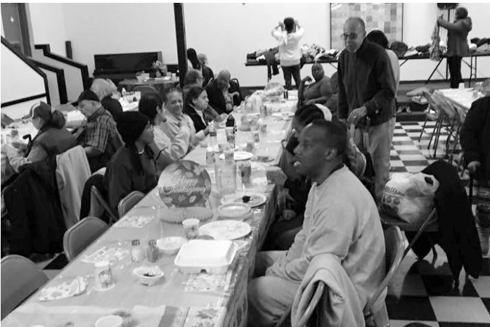
Annual Thanksgiving meal at Second Baptist Church