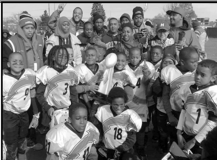
Frankford Chargers B Team

2017 LGFC Champions