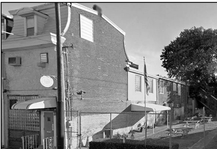
Post 224 at 2006 Orthodox Street