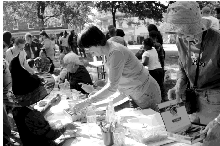
It was a record turnout at the Overington Park Fall Festival on October 21st on a warm Fall day. What more could you ask for?