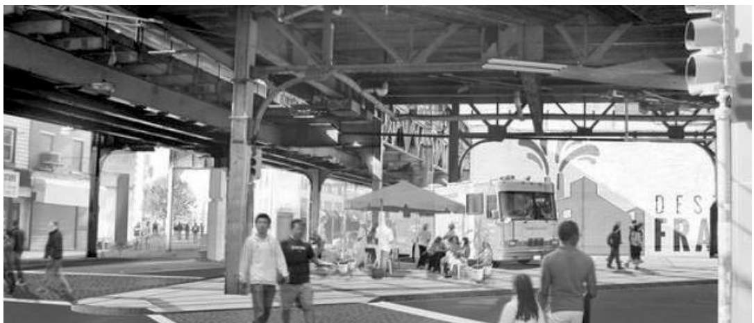
Proposed streetscape looking from the foot of Oxford Avenue across Arrott Street.

conceptual design of the streetscape improvements planned for the intersection of Margaret, Arrott, and Paul Streets with Frankford Avenue.