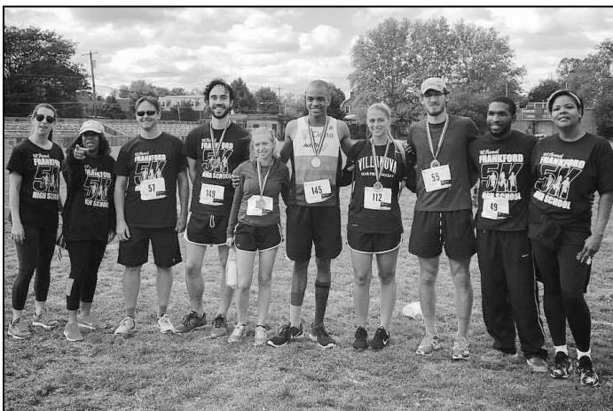
Winners of the 1st Annual Frankford High School 5k which was held on September 30th.