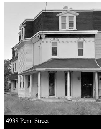
4938 Penn Street

4938 Penn Street —Rooming house for 6 people