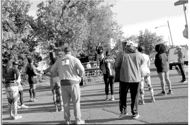
Runners warm up on October 21st before the start of the 2nd Annual Run4Frankford 5k organized by the Power Circle Mentors

This case goes back to April 16th, 2016 when the first hearing was held and the judge ordered the owner to do the repairs and get the house on the market for sale by June 1st. They did not comply but managed to forestall the conservatorship for almost a year and a half.