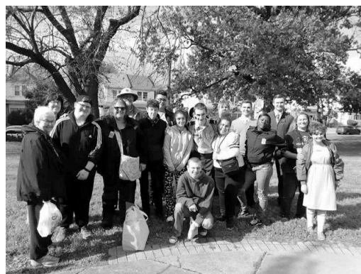
Fall Festival in Overington Park on October 20th was a Fun Day for all!