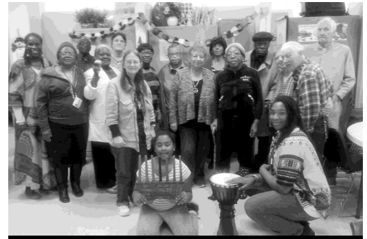
Kwanza celebration at the Peter Bressi Northeast Senior Center at 4744 Frankford Avenue

The Peter Bressi Northeast Senior Center is located at 4744 Frankford Avenue and can be reached at 215-831-2926 with any questions you may have. Also, like us on Facebook at Peter Bressi Northeast Senior Center. We would be delighted to meet and greet you at the Center.