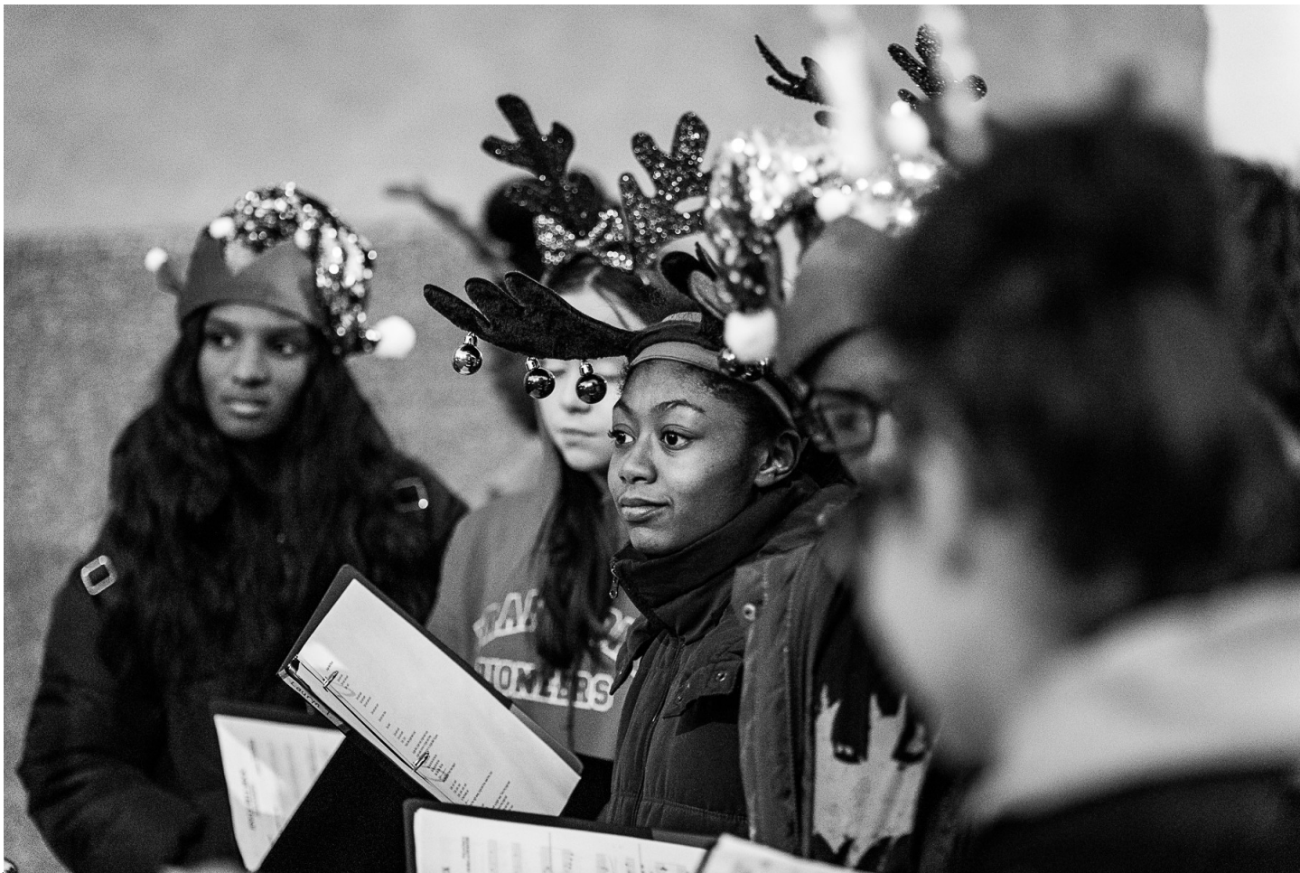
Philadelphia PA / USA. Frankford High School's choir perform during a Christmas tree-lighting event at Frankford Pause Park. December 07, 2018.