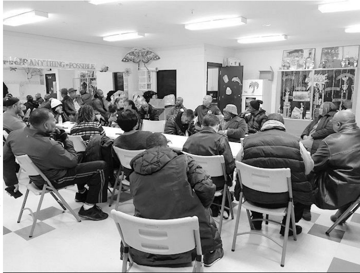
First meeting of the Stop the Bloodshed group at Gambrel Recreation center brought out over 25 people to brainstorm the problem and find solutions.