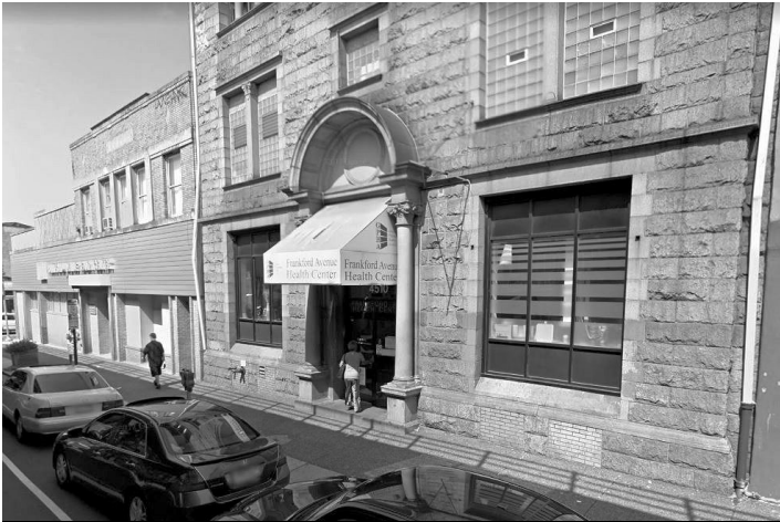
4500-14 Frankford Avenue