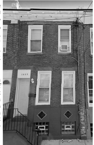
1625 Fillmore Street

1625 Fillmore Street – SPECIAL EXCEPTION FOR ROOMING HOUSE FOR MAXIMUM THREE (3) UNITS FOR MAXIMUM SIX (6) OCCUPANTS (GROUP LIVING). SOME OCCUPANTS MAY UNDER THE JURISDICTION OF COURT SYSTEM. ALL OCCUPANTS ARE CAPABLE OF SELF PRESERVATION AND SELF SUSTAINING IN AN EXISTING