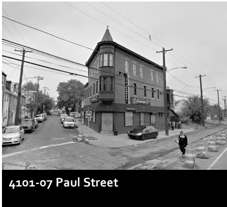
4101-07 Paul Street

ING UNITS IN AN EXISTING STRUCTURE. NO SIGNS ON THIS APPLICATION – Approved