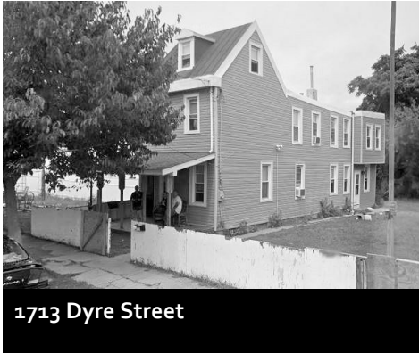
1713 Dyre Street

1713 Dyre Street – PERMIT TO CONVERT AN EXISTING SINGLE FAMILY HOUSEHOLD LIVING TO A SINGLE ROOM RESIDENCE – Legalization of a rooming house.- Approved