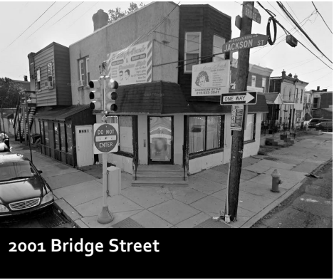
2001 Bridge Street

2008 Orthodox Street – PERMIT FOR FOUR (4) FAMILY DWELLING (MULTI-FAMILY DWELLING) IN AN EXISTING STRUCTURE – Approved for three family dwelling, not four.