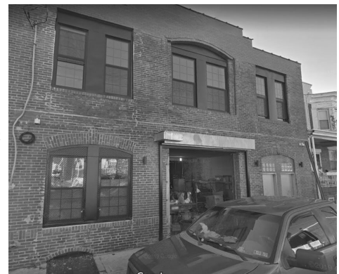
4637 Mulberry Street