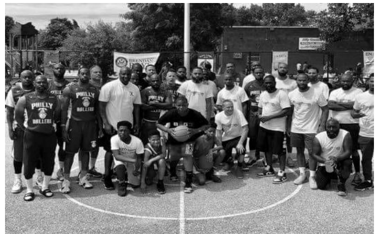
The Donovan Williams Memorial Foundation "Stop The Violence" All Star players.... Frankford vs Philly Ballers.... fkd up 2-0 in this series