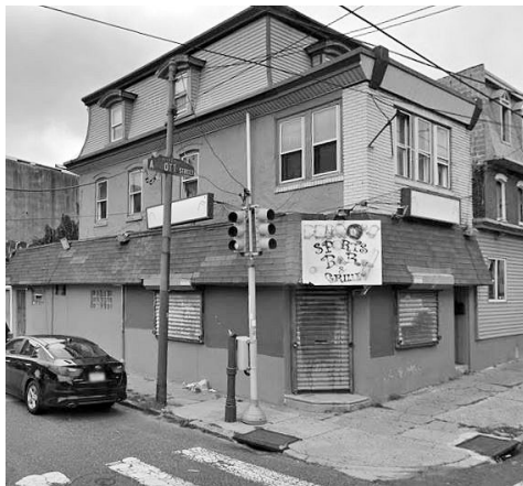
1520-22 Arrott Street

1520-22 Arrott Street – PERMIT FOR A SIT DOWN RESTAURANT ON 1ST FLOOR WITH EXISTING TWO (2) IN AN EXISTING STRUCTURE CREATES A CONDITION OF MULTIPLE MAIN USES ON A LOT. – continued , applicant and lawyer could not make meeting.