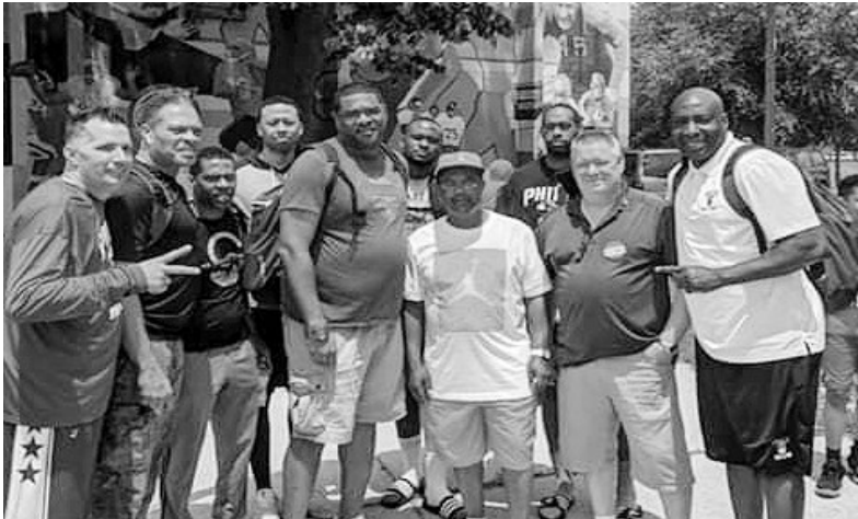
The Donovan Williams Memorial Foundation thanks The Philly Ballers for participating in the "Stop The Violence" Basketball Tournament.