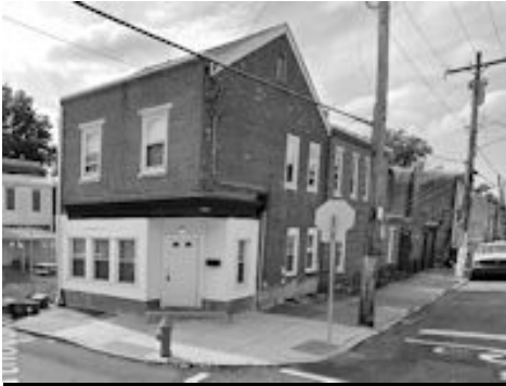
2000 Orthodox Street

2000 Orthodox Street – PERMIT FOR A TWO (2) FAMILY DWELLING IN AN