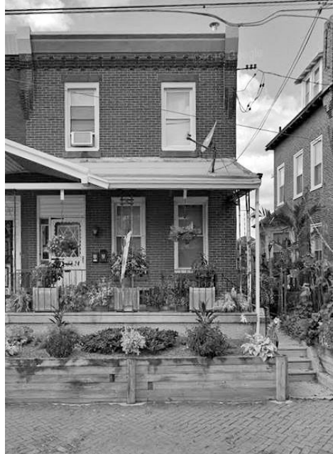
4924 Duffield Street

4340 Leiper Street - PERMIT FOR USE AS TWO (2) FAMILY HOUSEHOLD LIVING IN AN EXISTING SEMI-DETACHED STRUCTURE non-opposition