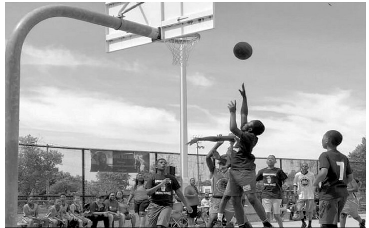
Team Evolution vs Kingsessing Kings