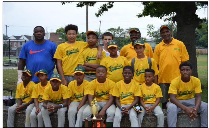
The Gambrel Hawks won the 12 & under 2016 Heritage League Baseball Championship. Congratulations on a great season.

Food and fellowship to follow after the Mass.