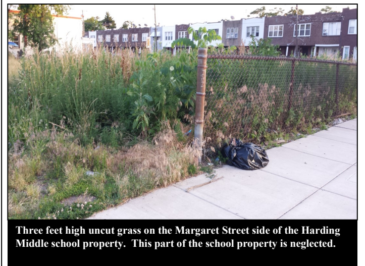
Three feet high uncut grass on the Margaret Street side of the Harding Middle school property. This part of the school property is neglected.