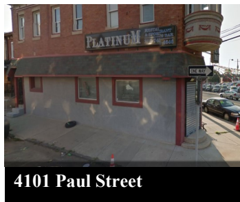
4101 Paul Street

A liquor application was filed on Oct. 22, 2015, and was approved for "Prior Approval Safekeeping" on July 22, 2016. That means the PLCB (Pennsylvania Liquor Control Board) has approved the transfer of the license, and the license is now in safekeeping, which means it is not in use. Once the premises are constructed, the PCLB will inspect them. If the premises are completed as they appear on the approved plans, the PLCB can issue operational authority. No protests were received during the protest period. The license is held by 4101 New Additions Inc.