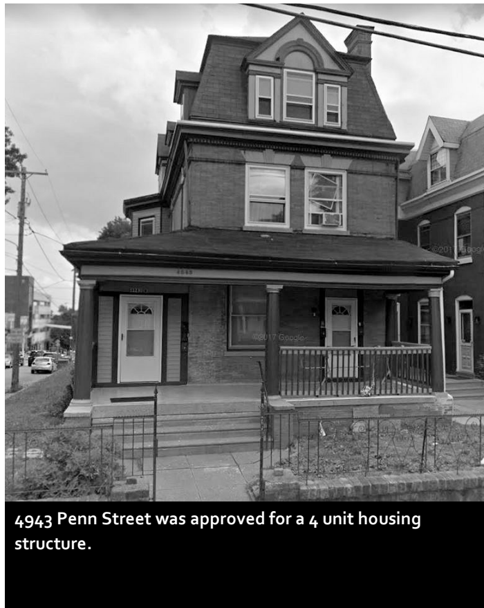
4943 Penn Street was approved for a 4 unit housing structure.

4122 Kensington Avenue – PERMIT FOR PROPOSED WELDING OF RAILINGS (GENERAL INDUSTRIAL) IN SPACE B AND PROPOSED AUTO MECHANIC SHOP TO INCLUDE SPRAY PAINTING (PERSONAL VEHICLE REPAIR AND