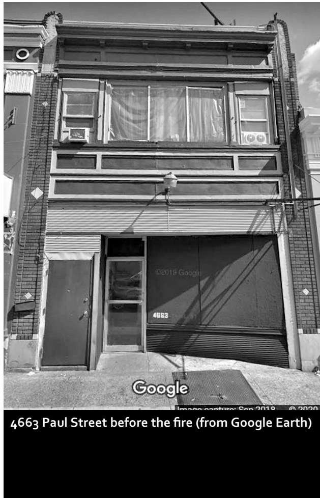
4663 Paul Street before the fire